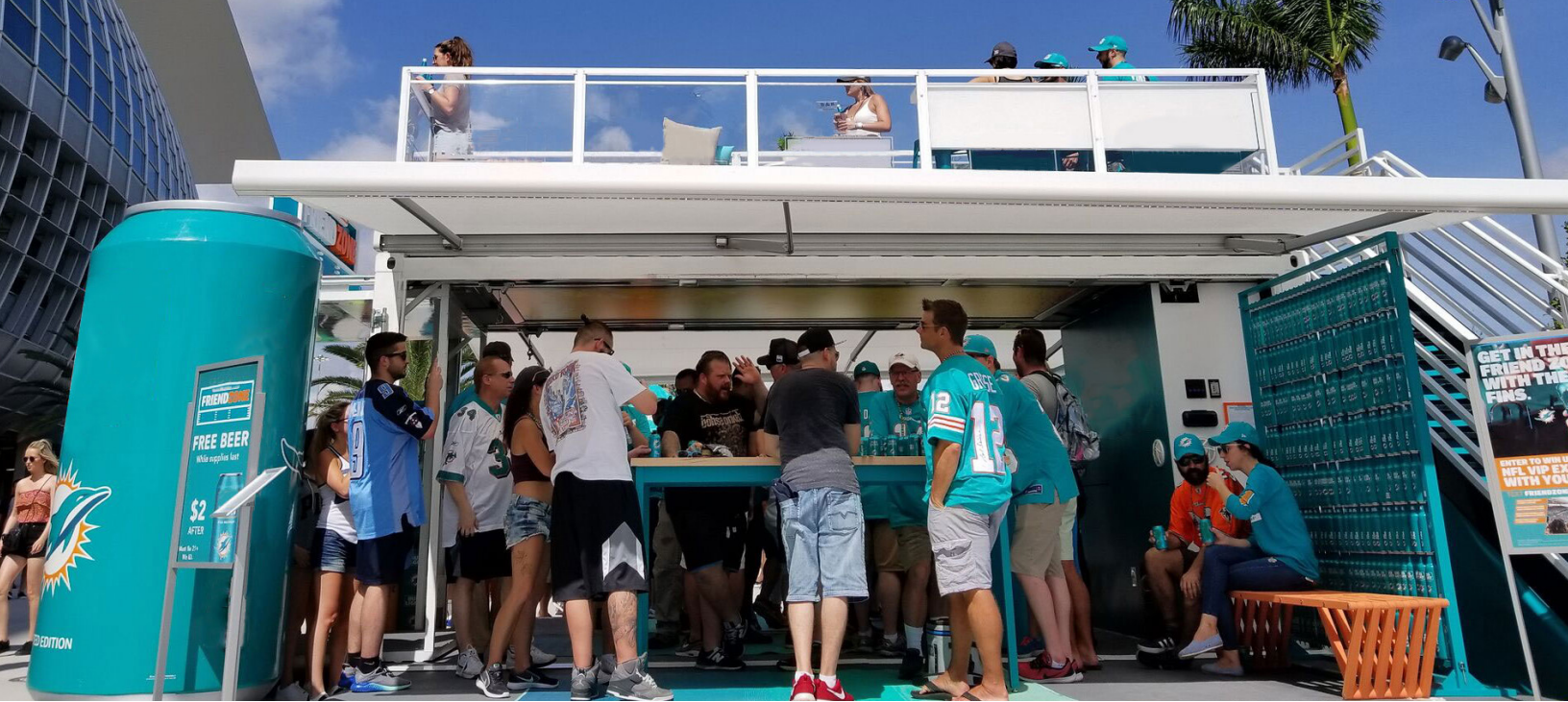
Miami Dolphins "Bud Light Friend Zone" by BoxPop®